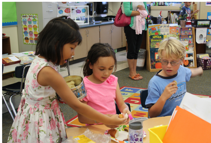
Breaking Bread Day