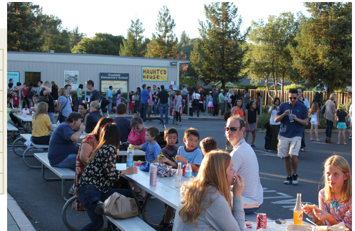
Fall Family Festival