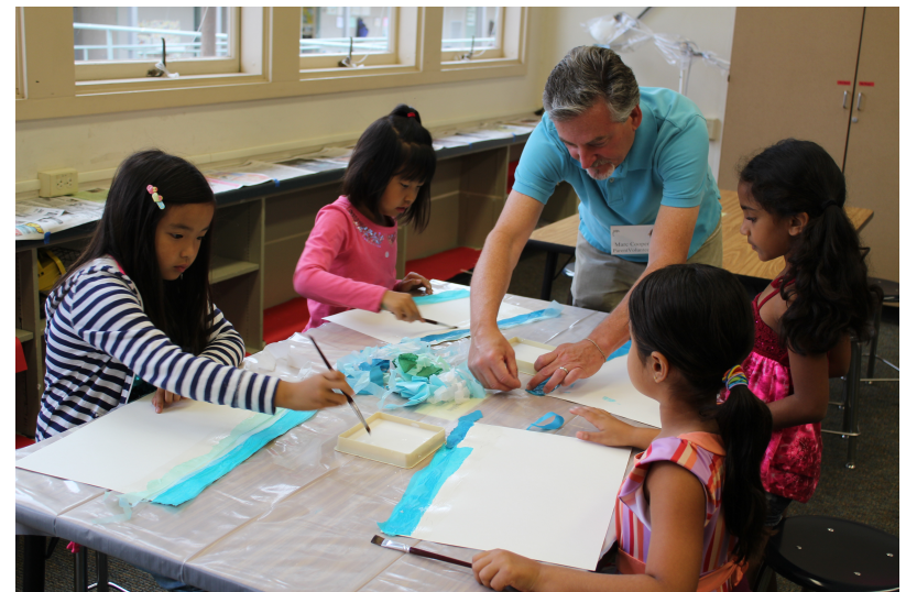
Art Docent Supplies